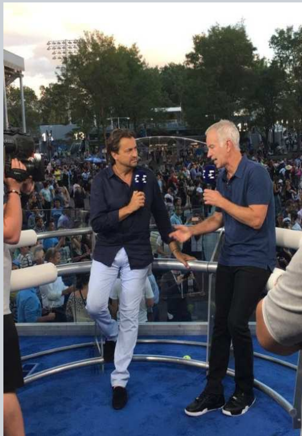
US Open with John McEnroe

Henri worked on Eurosport France from 2011 to 2021. He had his tv show « Avantage Leconte » until 2018.